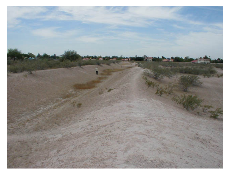
Photograph 2. Remains of a prehistoric Hohokam irrigation canal at "Park of the Canals", in Mesa, Arizona. This city park is located at 1710 N. Horne in Mesa.

In 1878, Mesa was founded by Mormon pioneers. Upon exploration, they discovered the Hohokam's abandoned canals, parts of which they used to develop their own irrigation system. Evidence of the canals can be seen today at the 31-acre "Park of the Canals." This is one of the only areas where the remains of the prehistoric canals can be easily observed. Their size and scope is amazing (see Photograph 2), and a stop here is well worthwhile. In addition to the canal remains, the parks boasts a desert botanical garden featuring vegetation from four different desert regions. Additionally, a large playground area is available for children.